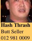
Hash Thrash Butt Seller 012 981 0009