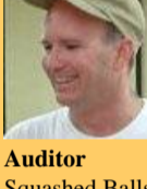
Auditor Squashed Balls 019 915 0612