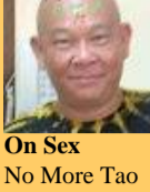
On Sex No More Tao 012 983 8321